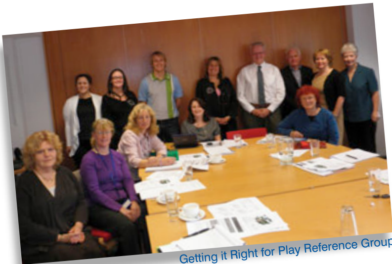
Getting it Right for Play Reference Group